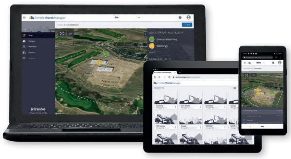
Trimble WorksManager Software